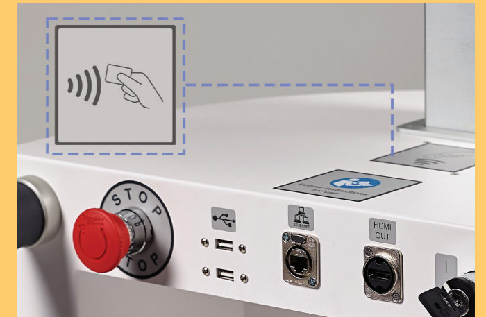
Instant login via the NFC device.