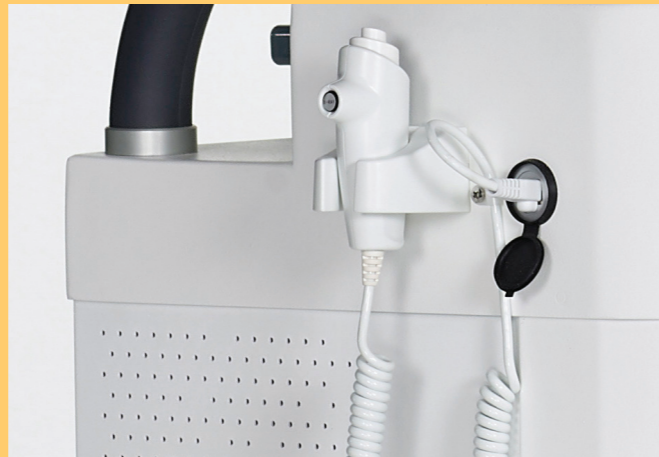
X-ray emission mode controlled using either a footswitch or a multi-function hand switch.