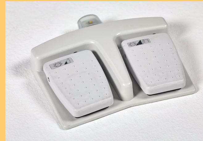
Function control via wireless footswitch for less cables on the floor.