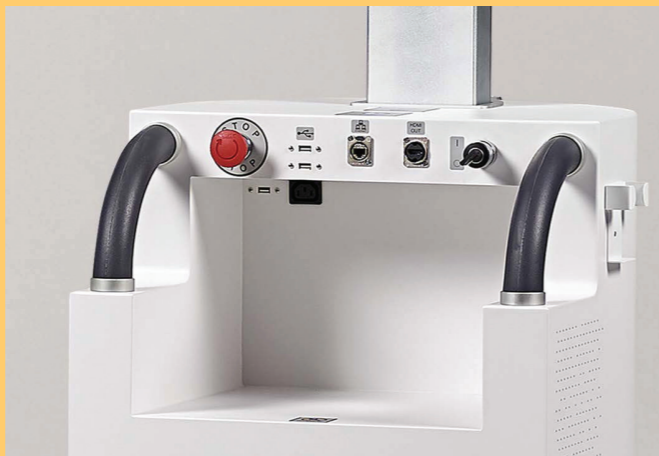
Ergonomic handles to suit all operators, for precise positioning and safe movement between operating theatres.