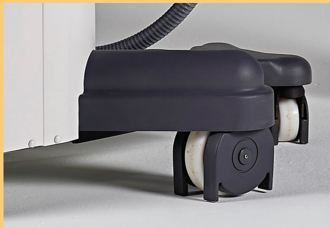
Soft bumpers on base to prevent painful knocks and mechanical damage.