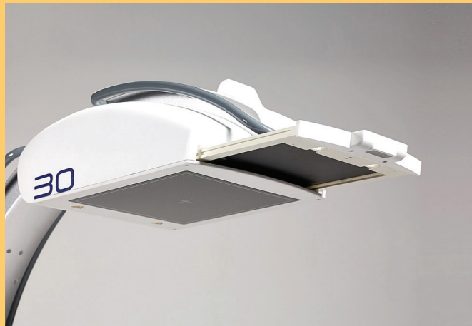
Removable grid for low dose pediatric procedures.