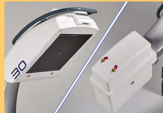
Zero dose centring thanks to laser localizers on X-ray tube and flat panel detector side.