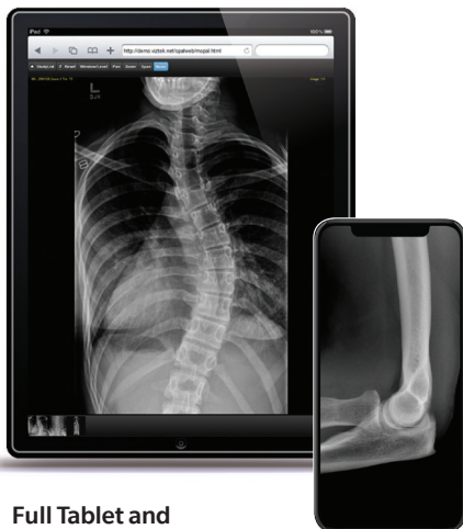
Full Tablet and Smartphone Access